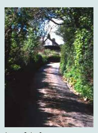
Lane to Catlow Bottoms

The reservoir was created in 1869 by damming the flow of Walverden Water. When Nelson began expanding in the mid 19th century, the stream was a main source of water both for the many mills along its course and for domestic use. The resulting pollution was a major factor in the setting up of a Local Board in 1864. The reservoir now provides water for Nelson and serves as a recreational facility and nature reserve.